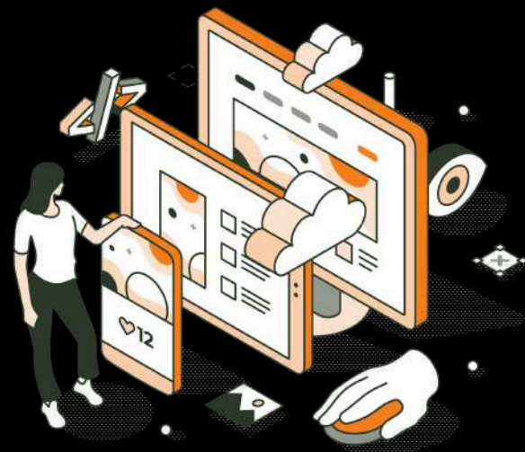
Landing Page Creation