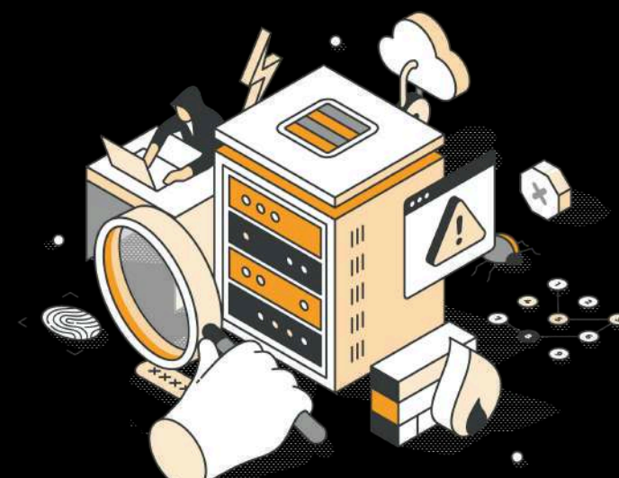
Website Maintenance & Optimization