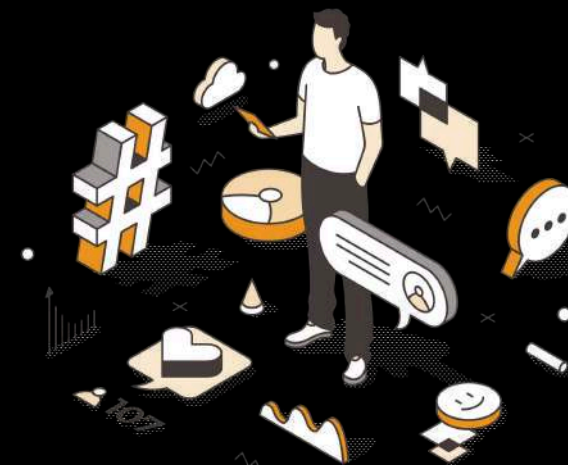
Social Media Marketing & Ads