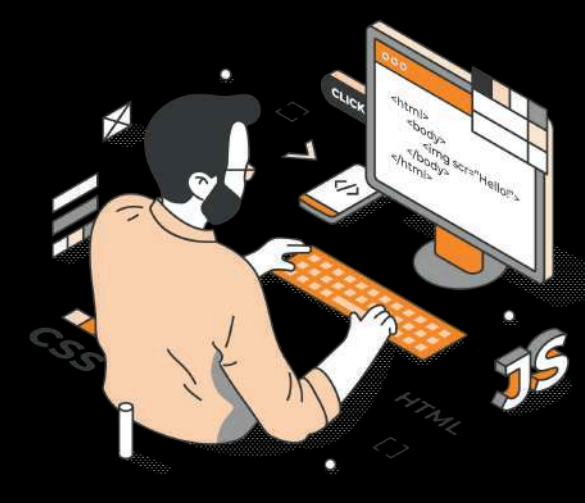
Website Design & Development