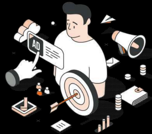
Google & Meta Ads